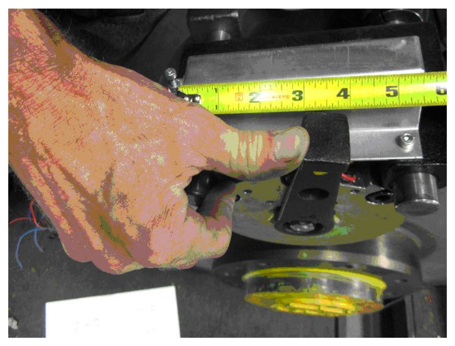
Figure 3: Measuring Stroke