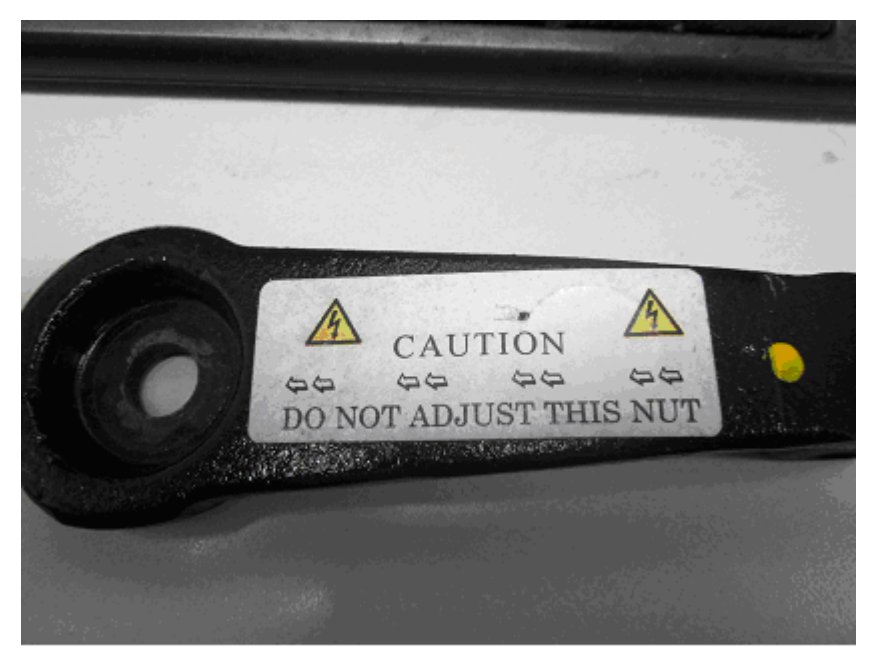
Figure 6: Install Caution Sticker