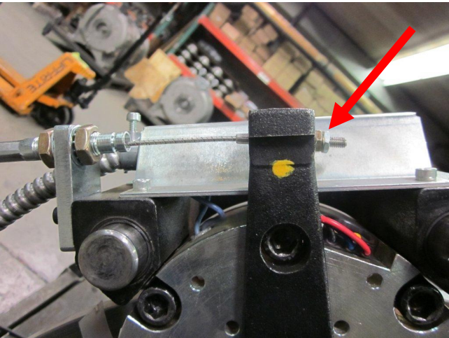
Figure 1: Remove Nuts on Release Cable

1) If a Hand Release Cable has been installed, first loosen and remove nuts securing Cable End (see Figure 1) to the Brake Release Lever Arm.