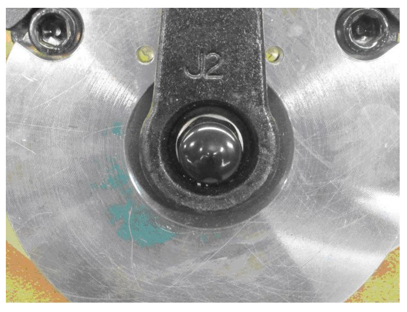
Figure 5: Cap Installed over Nut "A"

4) Apply plastic cover to nut, and apply "DO NOT ADJUST" signage (extra stickers available from Hollister-Whitney on request)